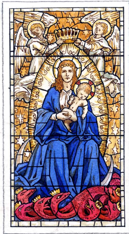
Window design Three: sadly never made

SKETCH DESIGN FOR No. 6 WINDOW CHRIST CHURCH WELLINGTON SALOP.