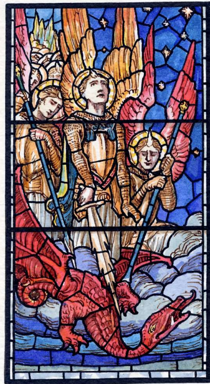
CHRIST CHURCH - WELLINGTON - SALOP. WINDOW - APOCALYPSE SERIES No. 6. "WAR IN HEAVEN" REV. 12. SCALE 1" = 1'